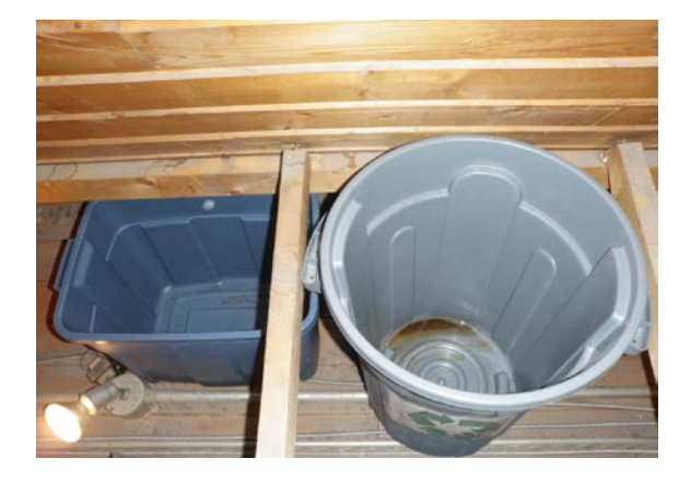
Tubs to catch drips inside the Church

Total cost for repairs is estimated at $400,000 with $260,000 just for the roofs.