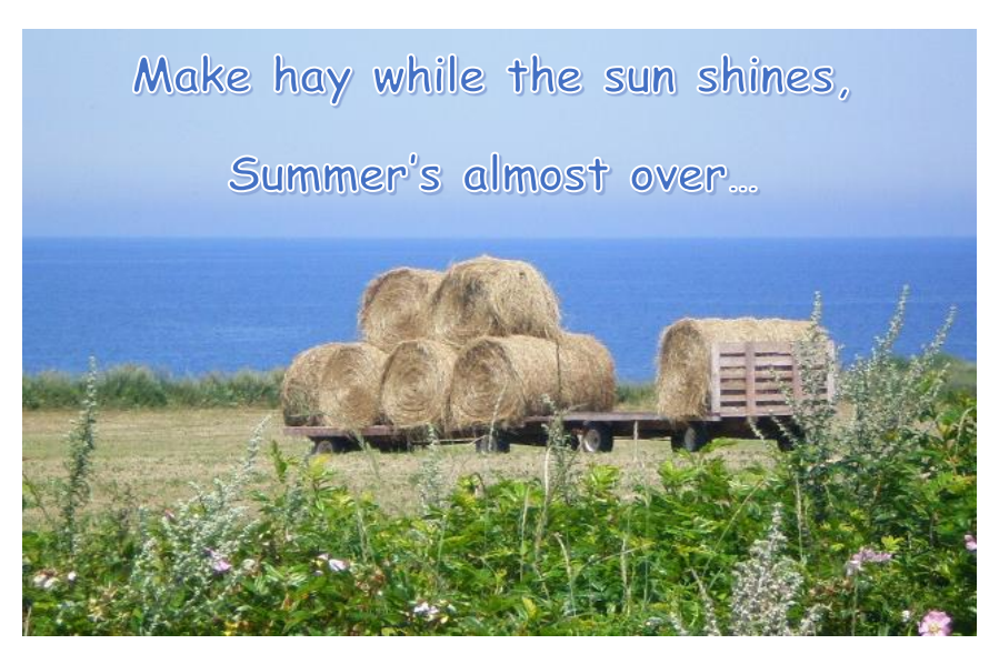
Photo taken on Prince Edward Island, August 2007